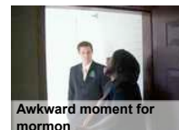
Awkward moment for mormon