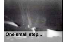
One small step...