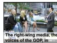
The right-wing media, the voices of the GOP, in