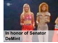
In honor of Senator DeMint