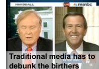
Traditional media has to debunk the birthers