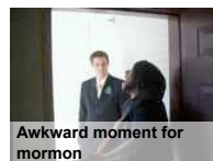
Awkward moment for mormon