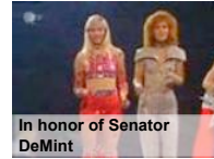
In honor of Senator DeMint