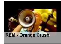
REM - Orange Crush