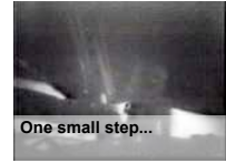
One small step...