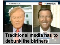
Traditional media has to debunk the birthers