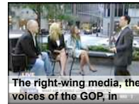
The right-wing media, the voices of the GOP, in