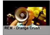
REM - Orange Crush