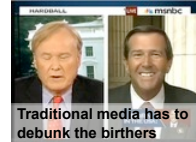
Traditional media has to debunk the birthers