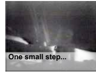
One small step...