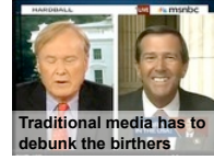
Traditional media has to debunk the birthers