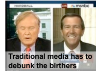
Traditional media has to debunk the birthers