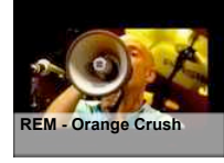
REM - Orange Crush