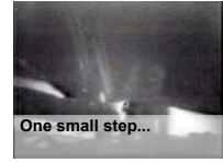
One small step...