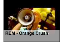
REM - Orange Crush