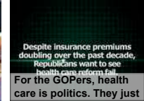
For the GOPers, health care is politics. They just