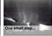
One small step...