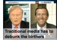
Traditional media has to debunk the birthers