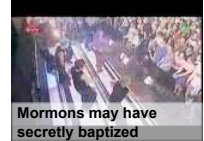
Mormons may have secretly baptized