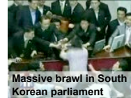
Massive brawl in South Korean parliament