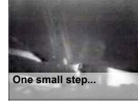
One small step...