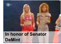
In honor of Senator DeMint