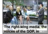
The right-wing media, the voices of the GOP, in