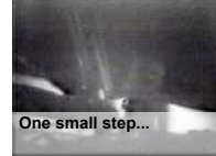
One small step...