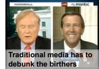
Traditional media has to debunk the birthers