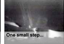
One small step...