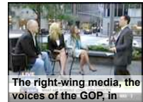
The right-wing media, the voices of the GOP, in