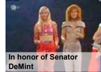
In honor of Senator DeMint