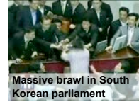
Massive brawl in South Korean parliament