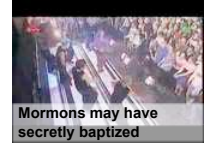
Mormons may have secretly baptized