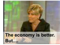
The economy is better. But...