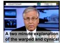
A two minute explanation of the warped and cynical