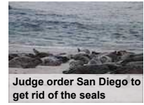
Judge order San Diego to get rid of the seals