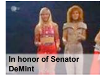
In honor of Senator DeMint