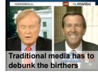
Traditional media has to debunk the birthers