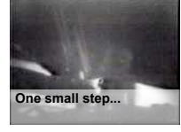
One small step...