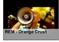
REM - Orange Crush