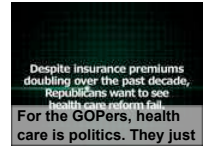
Despite insurance premiums doubling over the past decade, Republicans want to see health care reform fail. For the GOPers, health care is politics. They just