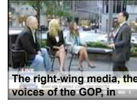
The right-wing media, the voices of the GOP, in