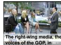
The right-wing media, the voices of the GOP, in