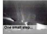
One small step...