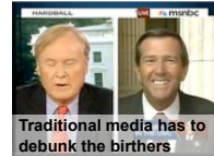
Traditional media has to debunk the birthers