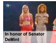
In honor of Senator DeMint