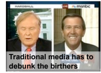
Traditional media has to debunk the birthers