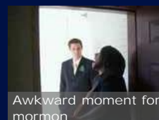
Awkward moment for mormon