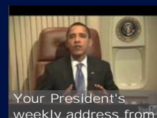
Your President's weekly address from