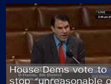
House Dems vote to stop "unreasonable or