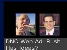
DNC Web Ad: Rush Has Ideas?