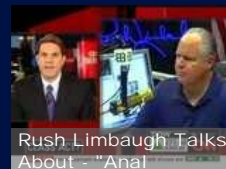
Rush Limbaugh Talks About - "Anal