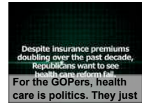
Despite insurance premiums doubling over the past decade, Republicans want to see health care reform fail. For the GOPers, health care is politics. They just