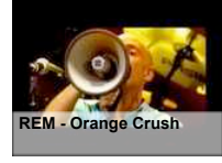
REM - Orange Crush