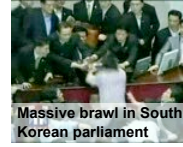
Massive brawl in South Korean parliament