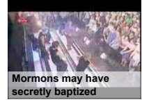
Mormons may have secretly baptized