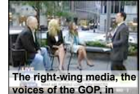
The right-wing media, the voices of the GOP, in