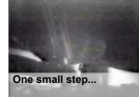
One small step...