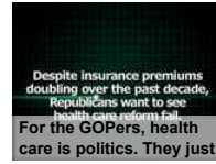
Despite insurance premiums doubling over the past decade, Republicans want to see health care reform fail. For the GOPers, health care is politics. They just