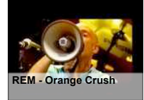
REM - Orange Crush