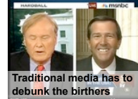
Traditional media has to debunk the birthers