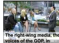
The right-wing media, the voices of the GOP, in