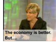
The economy is better. But...