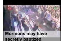
Mormons may have secretly baptized