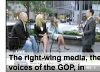
The right-wing media, the voices of the GOP, in