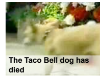
The Taco Bell dog has died