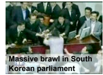
Massive brawl in South Korean parliament