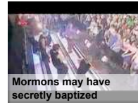
Mormons may have secretly baptized