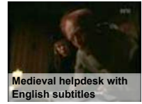
Medieval helpdesk with English subtitles