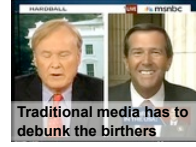
Traditional media has to debunk the birthers