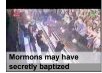
Mormons may have secretly baptized