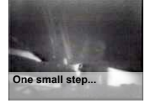
One small step...