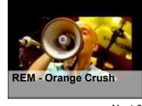
REM - Orange Crush