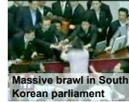
Massive brawl in South Korean parliament