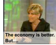
The economy is better. But...