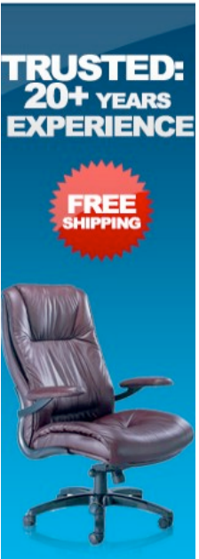
OfficeFurniture2go.com Ads by Google