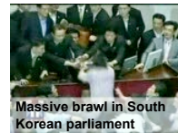
Massive brawl in South Korean parliament