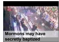
Mormons may have secretly baptized