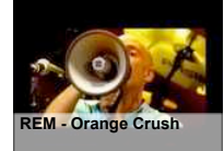
REM - Orange Crush