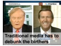
Traditional media has to debunk the birthers

Despite insurance premiums doubling over the past decade, Republicans want to see health care reform fail. For the GOPers, health care is politics. They just