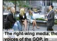
The right-wing media, the voices of the GOP, in