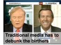
Traditional media has to debunk the birthers