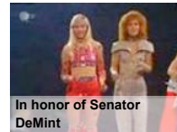
In honor of Senator DeMint