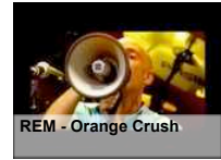
REM - Orange Crush