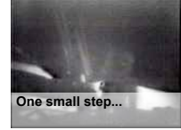
One small step...