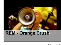
REM - Orange Crush