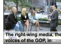
The right-wing media, the voices of the GOP, in