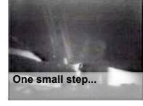
One small step...