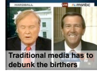
Traditional media has to debunk the birthers