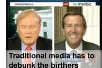
Traditional media has to debunk the birthers