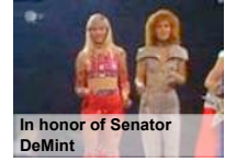
In honor of Senator DeMint