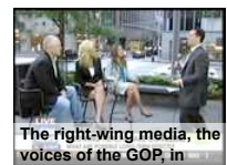
The right-wing media, the voices of the GOP, in