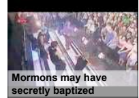
Mormons may have secretly baptized