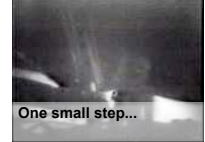
One small step...