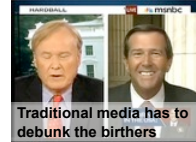
Traditional media has to debunk the birthers