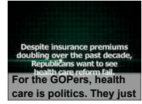
Despite insurance premiums doubling over the past decade, Republicans want to see health care reform fail. For the GOPers, health care is politics. They just