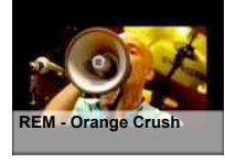
REM - Orange Crush