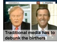
Traditional media has to debunk the birthers