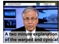
A two minute explanation of the warped and cynical