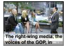
The right-wing media, the voices of the GOP, in