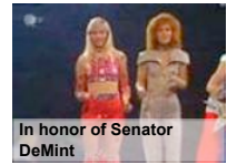
In honor of Senator DeMint