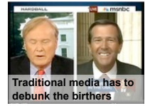
Traditional media has to debunk the birthers