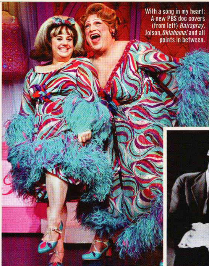
With a song in my heart: A new PBS doc covers (from left) Hairspray , Jolson, Oklahoma! and all points in between.