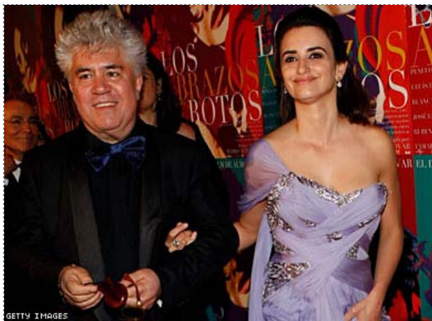
Pedro Almodóvar and Penelope Cruz

The big news at the 2009 Cannes Film Festival -- at least for queer cineasts -- was the ho-hum reception to new films from Pedro Almodóvar and Ang Lee and the breakout success of Montreal's out talent Xavier Dolan. Dolan wrote, directed, and stars in I Killed My Mother , a blisteringly funny account of a mother and son's love-hate (or, more often, hate-hate) relationship. It dominated the Directors' Fortnight, winning three top prizes, including best French-language film and best first or second feature.