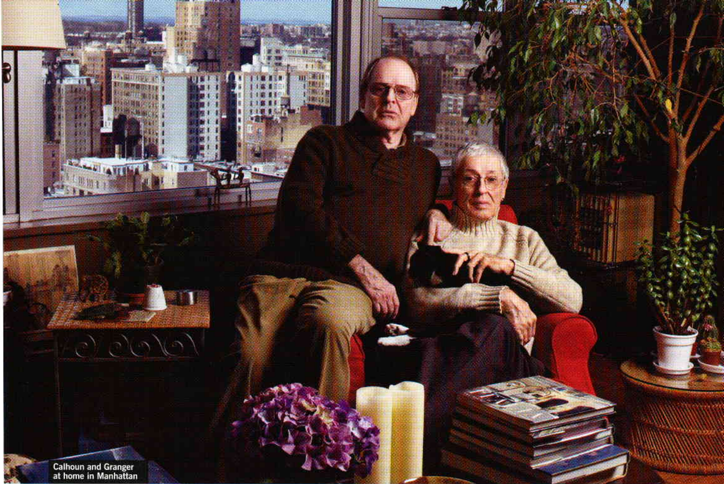
Calhoun and Granger at home in Manhattan

Senso in 1954 (an underrated film and one of Granger's best), Visconti's lover Franco Zeffirelli accidentally dyed Granger's hair bright pink.