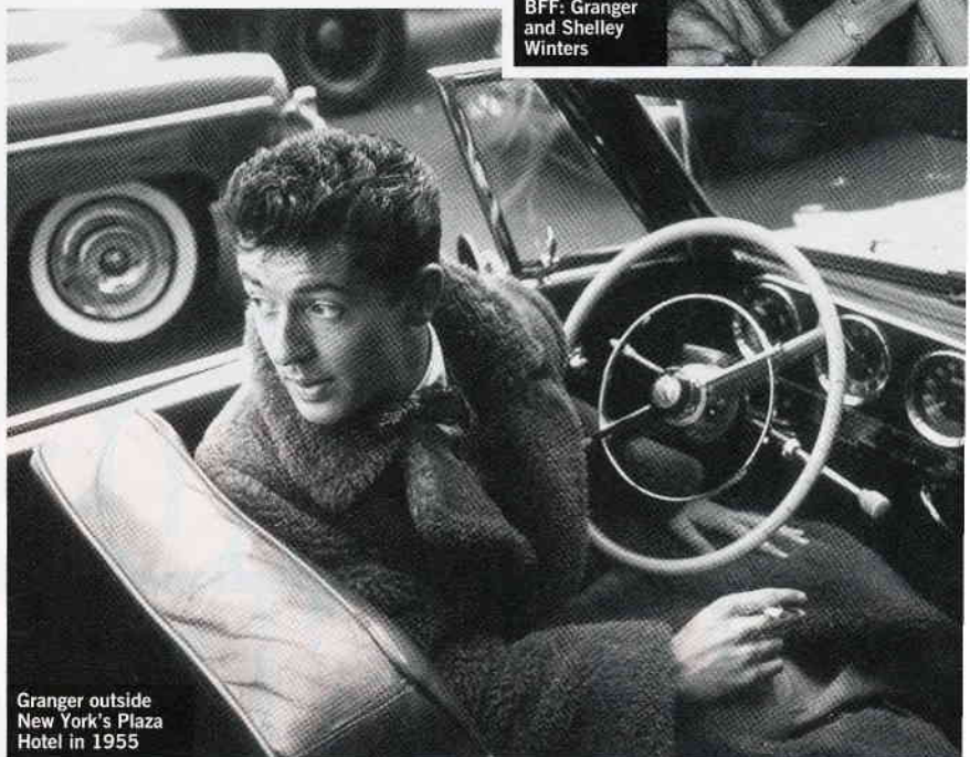
Granger outside New York's Plaza Hotel in 1955