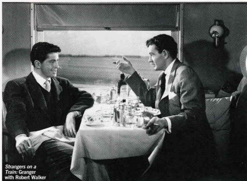
Strangers on a Train: Granger with Robert Walker