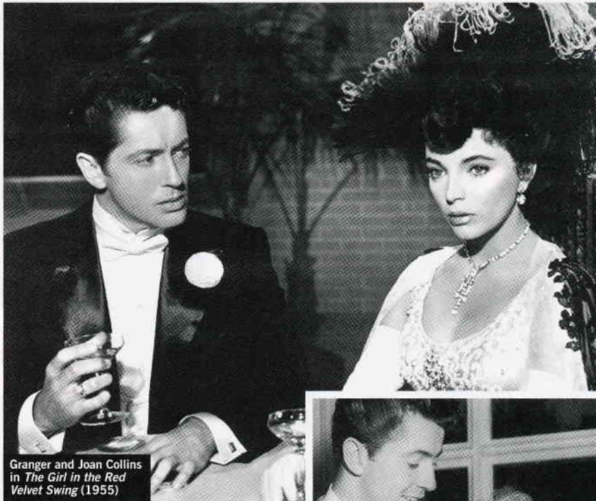
Granger and Joan Collins in The Girl in the Red Velvet Swing (1955)

"Not that I can think of," he says with a laugh. Who can blame him? ■