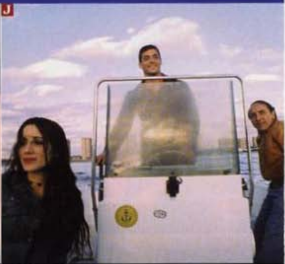
Lázaro Ramos is the real-life Madame Satã (left); a trio from one quarter of Boys Life 4 ; the love triangle from The Embalmer

WHO Reese Witherspoon, Bob Newhart, Sally Field, and Luke Wilson WHAT The delightfully ditsy Elle stumbles as an aide into the House of Representatives, which totally needs a makeover. She also finds time to fight for the rights of her gay chihuahua. WHY Witherspoon is delightful, and out director Charles Herman-Wurmfeld ( Kissing Jessica Stein ) is in charge behind the camera. HOW GAY Pretty dang gay