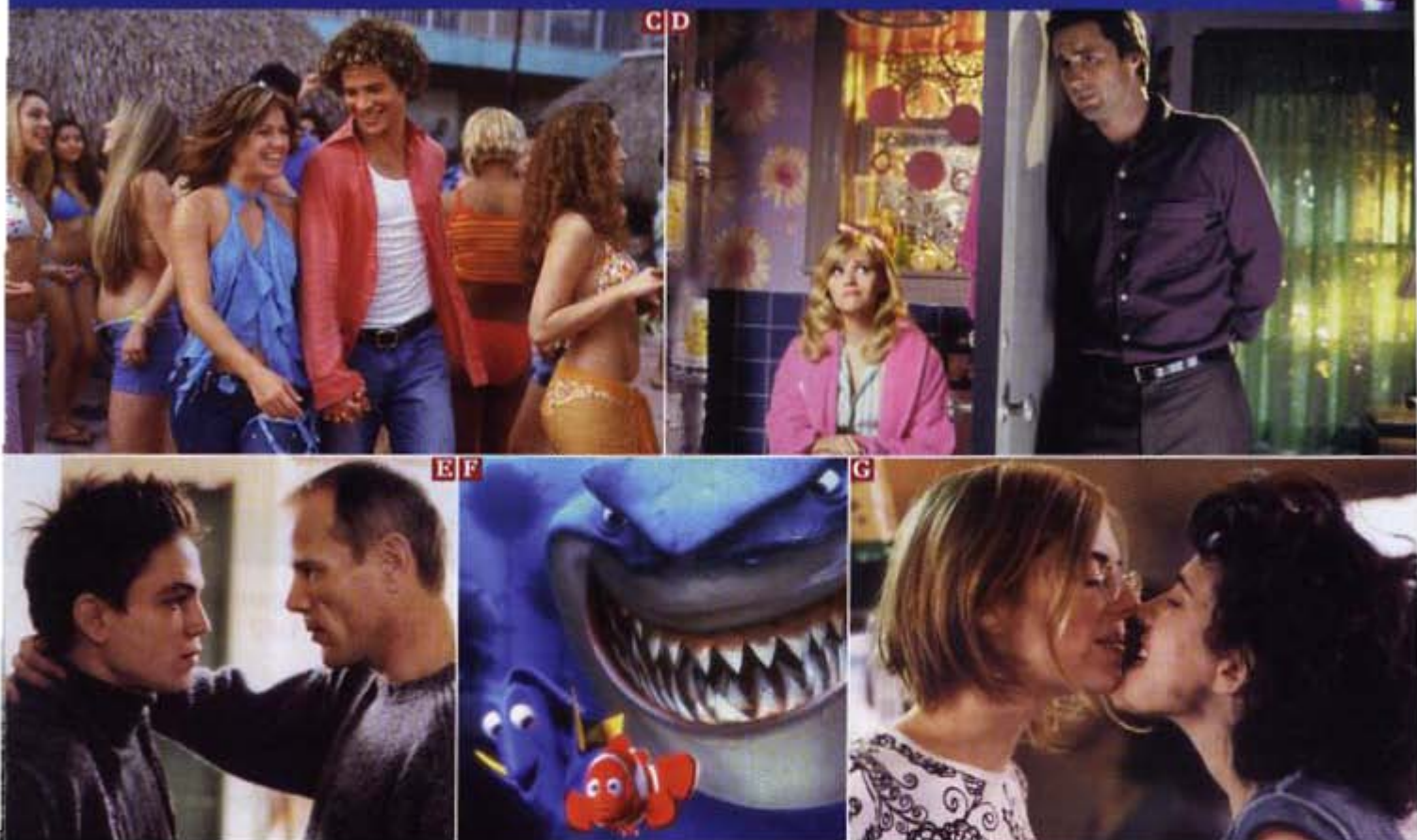
Clockwise from top left: Kelly Clarkson and Justin Guarini in From Justin to Kelly ; Reese Witherspoon and Luke Wilson, lawyers in love in Legally Blonde 2 ; Regina Orioli and Maya Sansa in Gasoline ; the fishies of Finding Nemo ; and Cyrille Thouvenin and Pascal Greggory in Confusion of Genders

the big screen, losing an adjective but gaining Bana and Connelly in the process. The computer-generated Hulk in the early trailers looked iffy, but we have faith in director Ang Lee ( The Wedding Banquet ; Crouching Tiger, Hidden Dragon ).